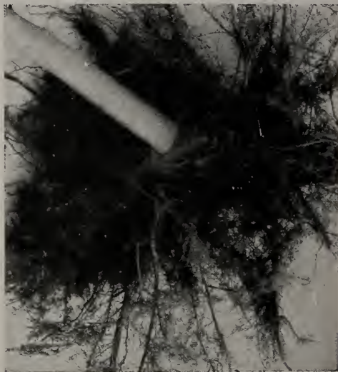
Root System of Oft-Transplanted Tree

THIS tree has been oft transplanted. All Rosedale trees are. The result is a compact mass of fibrous roots close to the trunk. Thus the foundation is safe from the digger's spade and you are insured against loss or tardy growth.